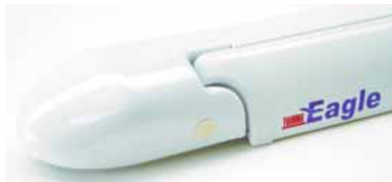
Eagle Motor Kit Left